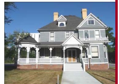
Dr. Thomas M. Jordan House ca. 1898 (D)

*Legacy Construction home office. (S) Private residence. (1) NC Independent Colleges & Univ. (2) Leonidas Polk House museum. (3) Murphy School elderly apts. (4) Burning Coal Theater. (4) Historic Oakwood. (5)