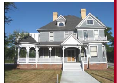
Dr. Thomas M. Jordan House ca. 1898 (D)