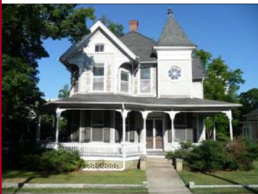
Cowper House ca. 1895 (C)

These site plans are an artist's representation only, not to scale, subject to change without notice.