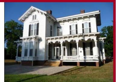
Merrimon-Wynne House ca. 1875 (B)