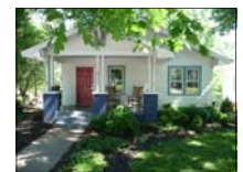
607 N Boundary St Raleigh, NC 27604