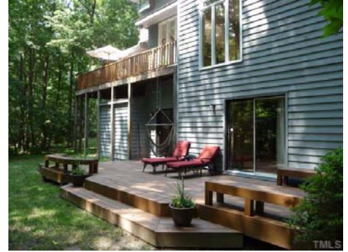
The biggest of the 4 decks opens onto the back yard with space for croquet, volley ball or quiet contemplation. The lower level includes unfinished 388 sqft for storage and a workshop.