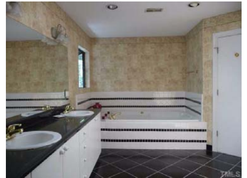
Three of the four full baths were recently remodeled, including the master bath, shown here, with a Jacuzzi.