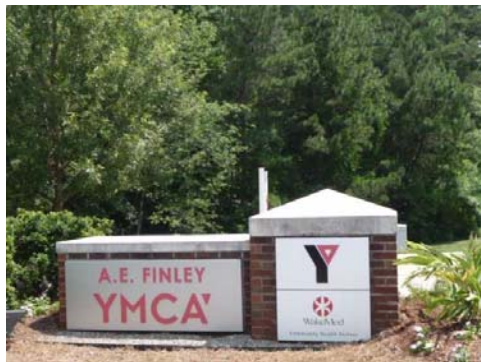
It is hard to believe that this quiet, cul-de-sac doorstep, nestled in the Crosswinds Subdivision, is in the very heart of the new north Raleigh that includes swim, tennis and health clubs, shops, offices and services.