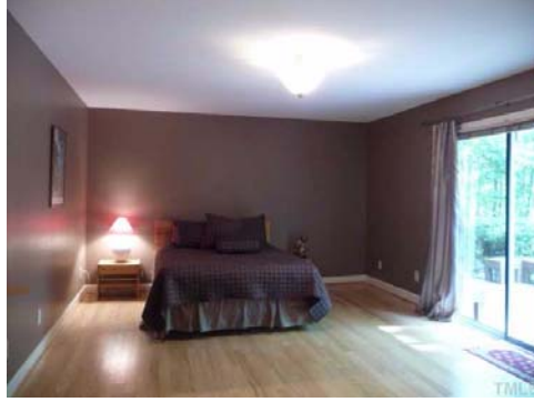
The versatile 18x12 ft bedroom on the lower level is flex space at its best, offering options as a stand alone rec room, office or studio, or as part of a larger in-law suite.