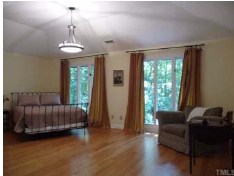
The master suite includes a 20x13 ft bedroom with a gently sloping tray ceiling and large walk-in closet.