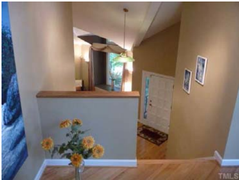
This picture is worth repeating. It shows the steps leading to the master bedroom suite and two other bedrooms on the upper level.