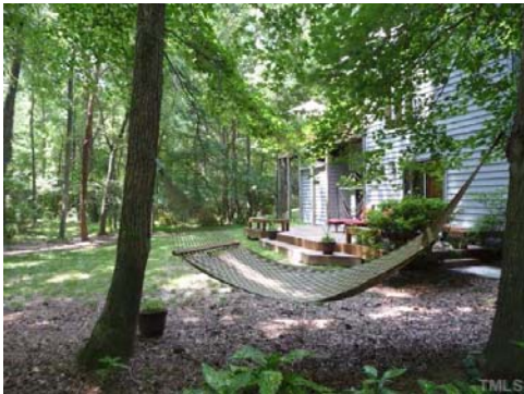
It is no surprise that the developer originally reserved this lot for himself.