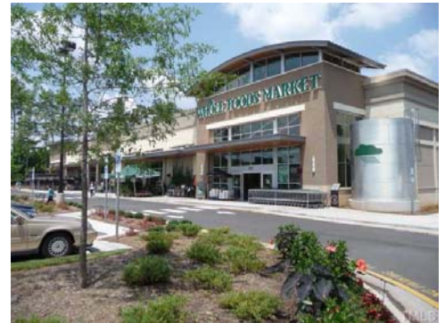
The new Whole Foods is less than a mile away at 8710 Six Forks Road. The Char-Grill and YMCA are even closer.