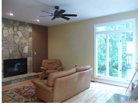
The family room location well away from the living and dining rooms offers a get-away during formal dinner parties, and an inviting space for whole house parties.