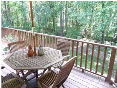
The view from above, showing the small creek running across the back of the lot.