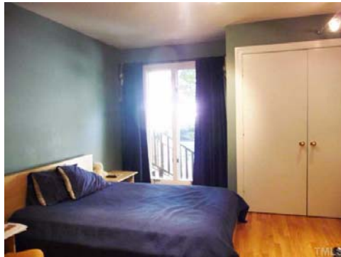
This main level bedroom, one of 5 total, could be a guest room or office. Hardwood floors are found throughout the house.