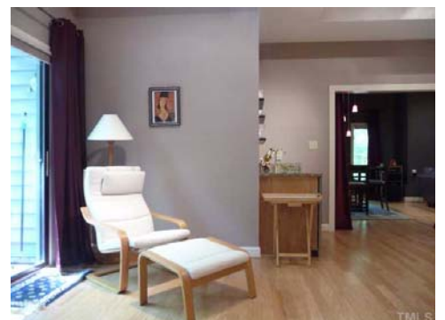
Back to the lower level. This is the study connecting the theater room with the bedroom on the lower level.