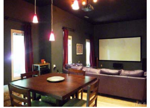
And there is more. The fully equipped theater room on the lower level is a versatile space that could be a living/dining area as part of an in-law suite that opens onto a ground-level deck in back. See pictures below.