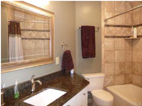
On the main level, the remodeled guest bath, with tile floors and surround, is also privately accessible from an adjacent bedroom.