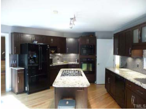
All new - granite counters and appliances including a gas range, oven, microwave and refrigerator.