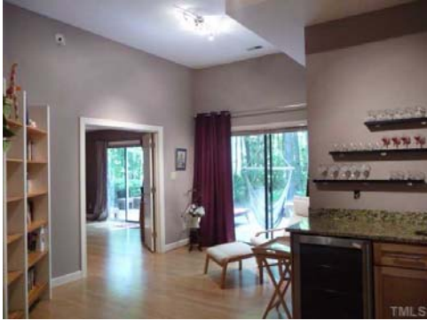
Bookshelves line one wall of the lower level study that includes a wet bar and wine cooler.