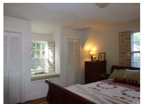
The two bright upstairs Bedrooms in the original house each have windows on three sides. The north BR shown here has three closets.