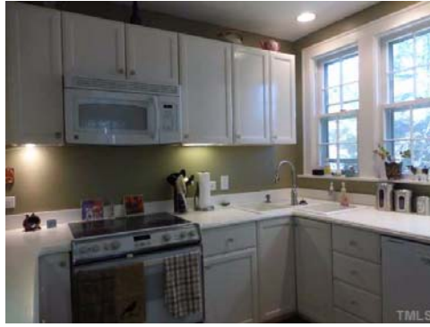
Solid surface counter tops are one of the many features of the modern Kitchen.