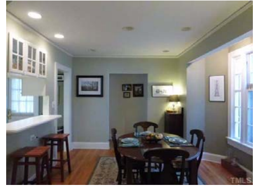
The passage leads to the two story addition on the south end of the house. The addition included the east facing front porch accessed from the Kitchen.