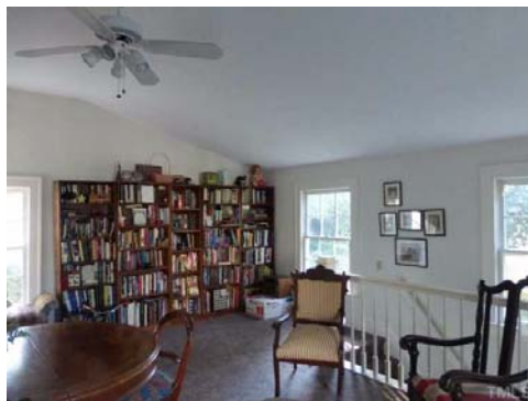
The big, bright Bonus Room/4th Bedroom (19x18 ft) is great flex space.