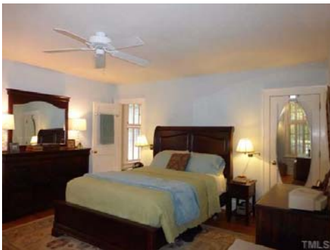
With hardwood floors and a walk-in closet.