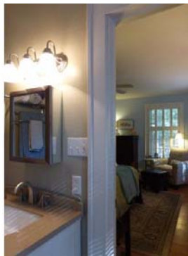
And a real Master Bath.