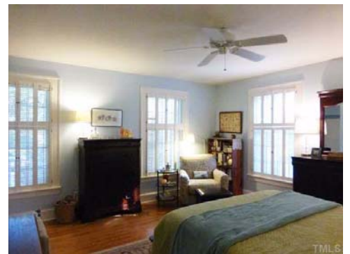
Finally, the Master Bedroom. It is big (16x14 ft) and bright.