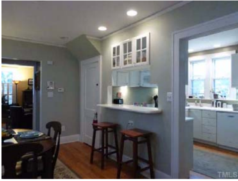
Nor is it your grandparents kitchen.