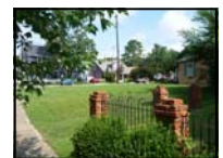
501 Oakwood Ave Raleigh, NC 27601