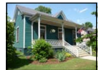
The Charles Goodwin House c.1896-7 515 Oakwood Ave Raleigh, NC 27601