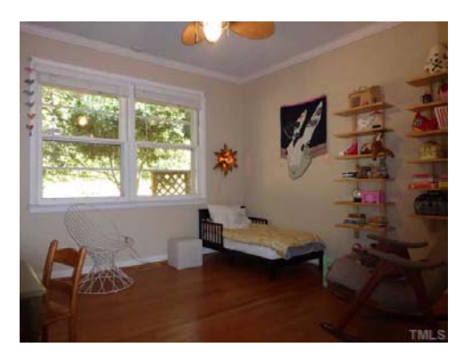
The third bedroom. The bedrooms have double-wide closets that are easily accessible. \boldsymbol{.}