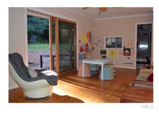
Enjoy the indoor-outdoor convenience of a brick patio, over 50 long, behind the Family Room and the adjacent Kitchen.