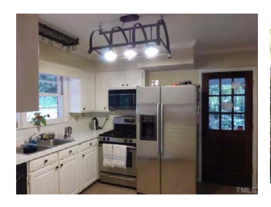
The existing kitchen opens through a side door to the carport.

2516 Oxford Road MLS#: 1972830 List Price: $395,000