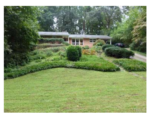
The sellers, and Louis Cherry before them, have explored options for relocating a parking area midway along the driveway.