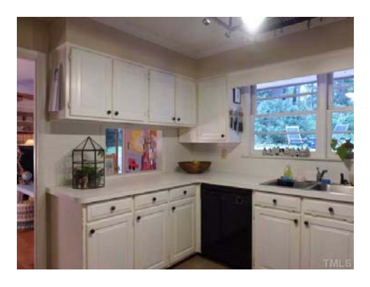
Another plan of the sellers was to expand the kitchen and DR in to the adjacent carport. <BR/>