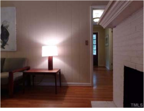
A new job in Switzerland has changed the plans of the sellers who occupied the house for two years as lease-purchase tenants. This is the view looking from the FR towards the Living Room and entrance Foyer.