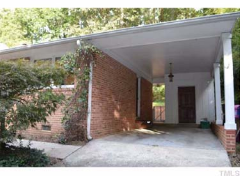
Room for two cars is provided by the carport and an adjacent parking pad.