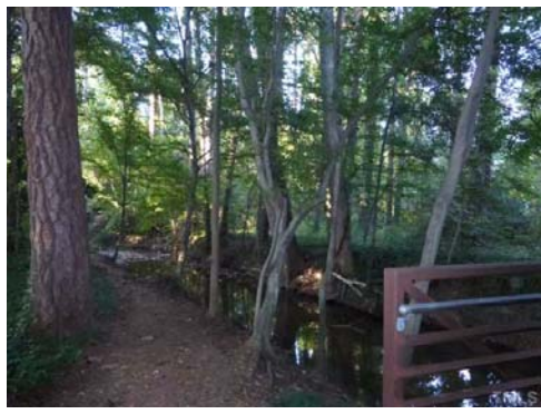
Fallon Park includes a winding path along the creek that is crossed by picturesque bridges. The creek leads to the Crabtree Creek Greenway and park to the northeast.