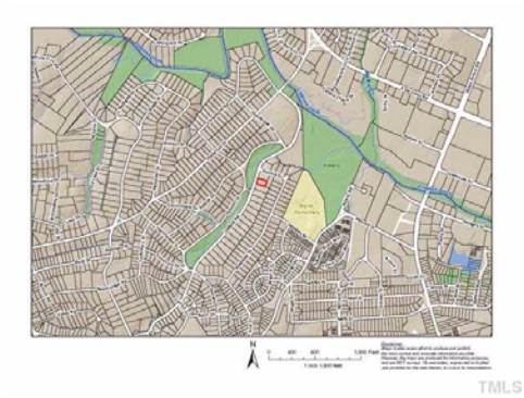
Overlooking Fallon Park, the house is a short walk away from the Crabtree Creek Greenway/Park and two schools, JY Joyner and Our Lady of Lourdes. Map available in MLS Documents.