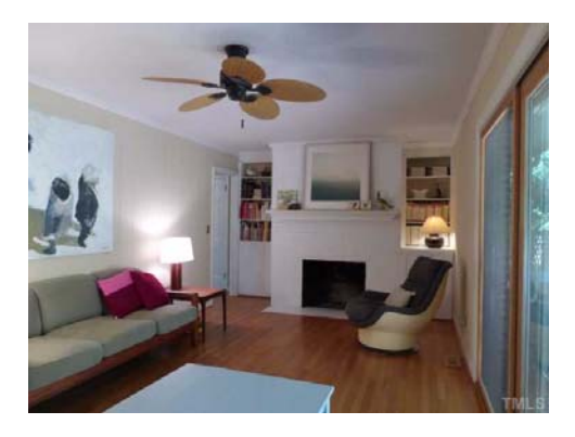
Indulge your inner architect. Plan a great room by removing the wall between the LR and FR. This was one dream of the sellers.

2516 Oxford Road MLS#: 1972830 List Price: $395,000