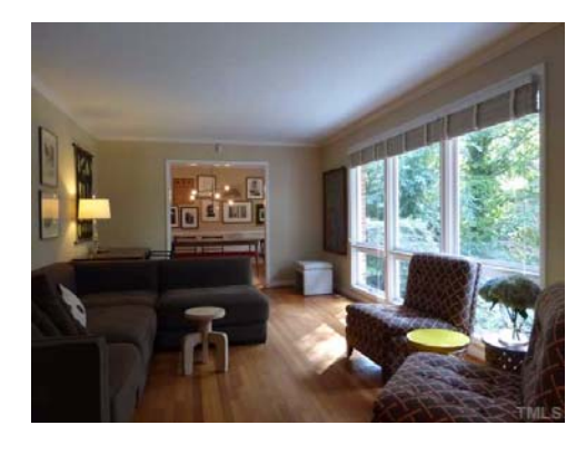
A wall of windows in the big 18x12 ft Living Room overlooks the yard and Fallon Park.