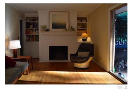
The morning sun brightens the even larger 23x11.2 ft Family Room in back with built-in bookshelves flanking a masonry fireplace.