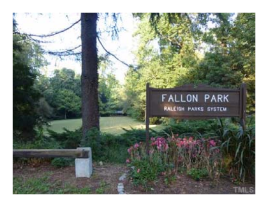
Fallon Park is a jewel with open fields and a picnic pavilion.