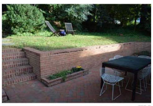
The patio is a great entertainment space and kids play area.