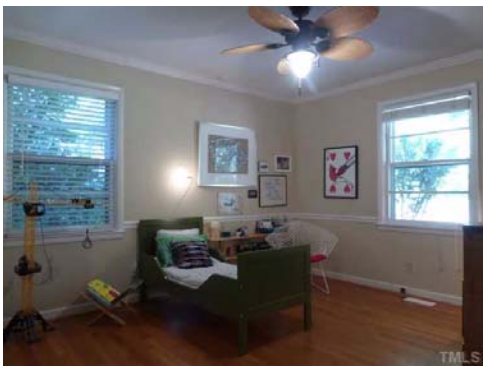
The back corner bedroom.