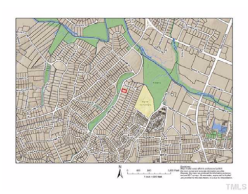
This location is a bulls eye, which is why the map is included a second time. Walk or bike to Five Points, North Hills, parks, schools and much more. Glenwood Ave is at the bottom left corner of the map.