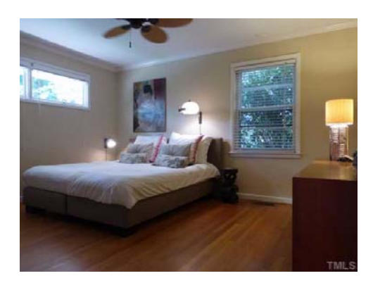
The sellers also explored expanding the already spacious Master Bedroom and bath with an addition to the front of the house.