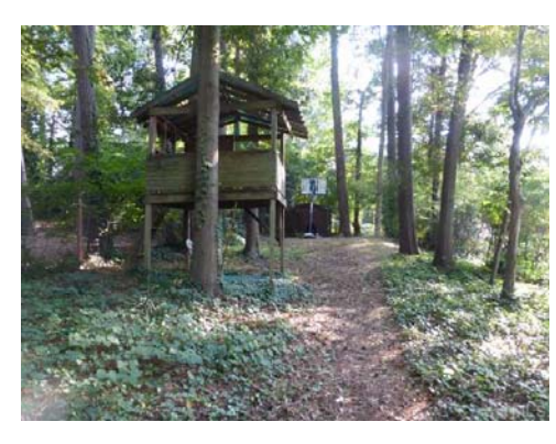
Hidden in the trees behind the patio, in the fenced back yard, is a tree house and basketball pad. The back board is borrowed.