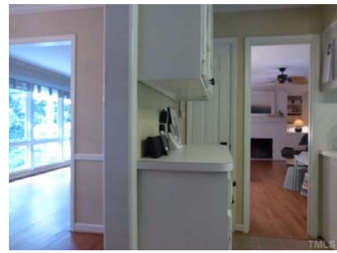
This is the view from the Kitchen with the LR and DR to the left and FR to the right.