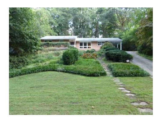
This home on 0.37 acres offers unique options to enjoy the existing big, bright spaces with sparkling hardwood floors, or to remodel and/or expand the home in a traditional or contemporary style.

2516 Oxford Road MLS#: 1972830 List Price: $395,000