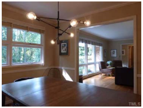
The afternoon sun sparkles on the hardwood floors, which are found throughout most of the house including the three bedrooms. This is the view from the Dining Room.