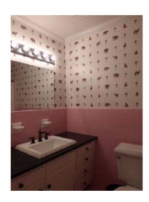
The hall bath includes the original vanity and pink tile, now back in style.