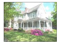
The Walter Clark House c. 1895 315 Polk St Raleigh, NC 27605