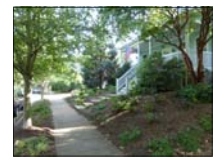
529 Watauga St Raleigh, NC 27604