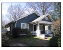
521 N Bloodworth St Raleigh, NC 27604